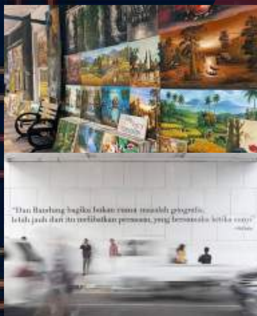
"Dan Bandung ingin lebih lanjut untuk menjadi destinasi wisata yang lebih baik dan lebih menarik, yang bermutu dan lebih maju"