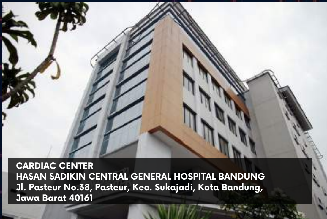
CARDIAC CENTER HASAN SADIKIN CENTRAL GENERAL HOSPITAL BANDUNG Jl. Pasteur No.38, Pasteur, Kec. Sukajadi, Kota Bandung, Jawa Barat 40161