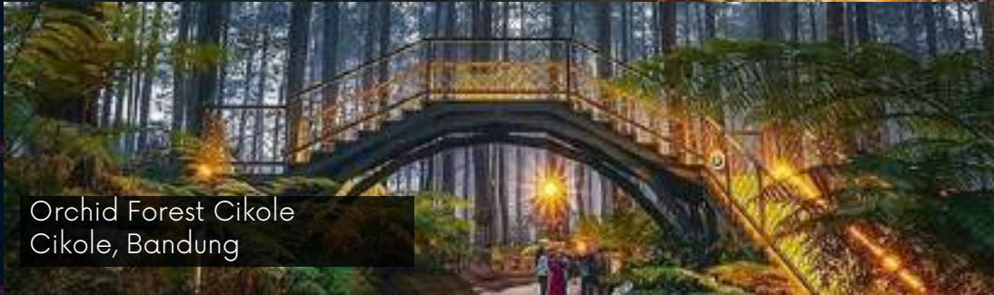
Orchid Forest Cikole Cikole, Bandung