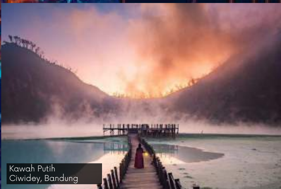
Kawah Putih Ciwidey, Bandung