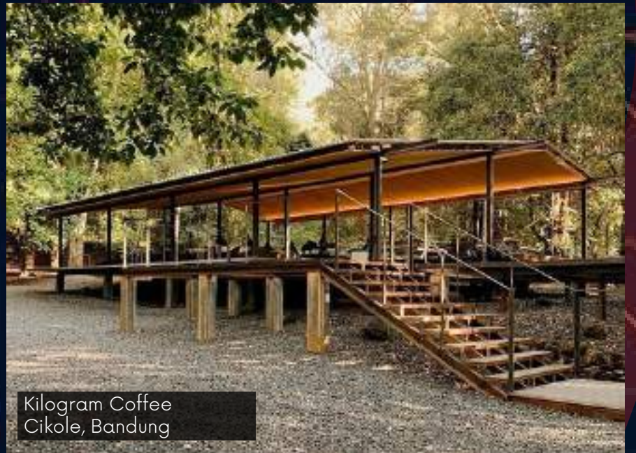
Kilogram Coffee Cikole, Bandung