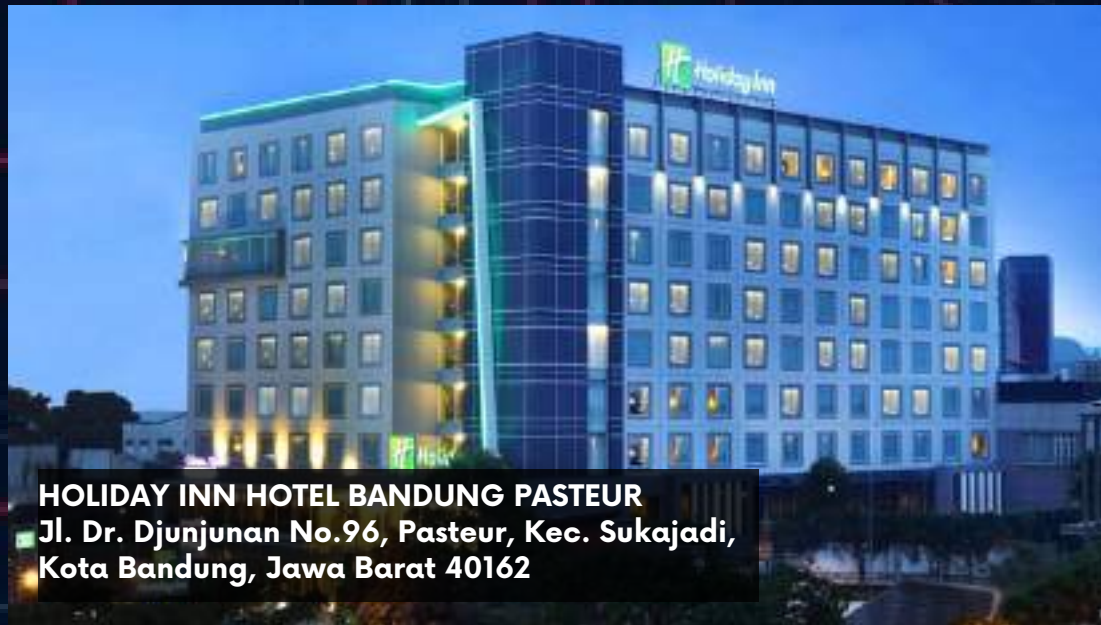
HOLIDAY INN HOTEL BANDUNG PASTEUR Jl. Dr. Djunjunan No.96, Pasteur, Kec. Sukajadi, Kota Bandung, Jawa Barat 40162