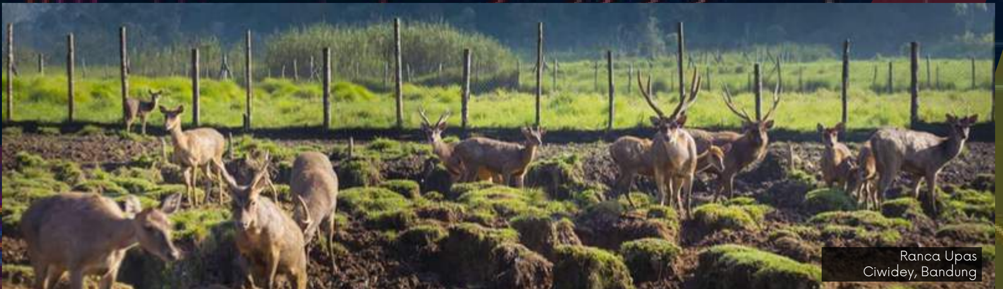
Ranca Upas Ciwidey, Bandung