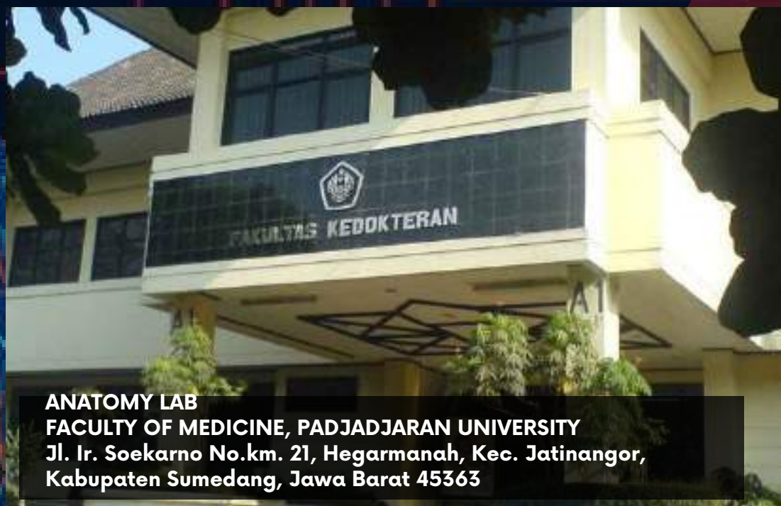
ANATOMY LAB FACULTY OF MEDICINE, PADJADJARAN UNIVERSITY Jl. Ir. Soekarno No.km. 21, Hegarmanah, Kec. Jatinangor, Kabupaten Sumedang, Jawa Barat 45363