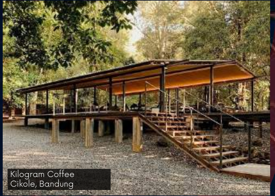
Kilogram Coffee Cikole, Bandung