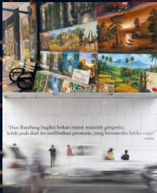
"Dan Bandung ingin lebih lanjut untuk menjadi destinasi wisata yang lebih baik dan lebih menarik, yang bermutu dan lebih maju"