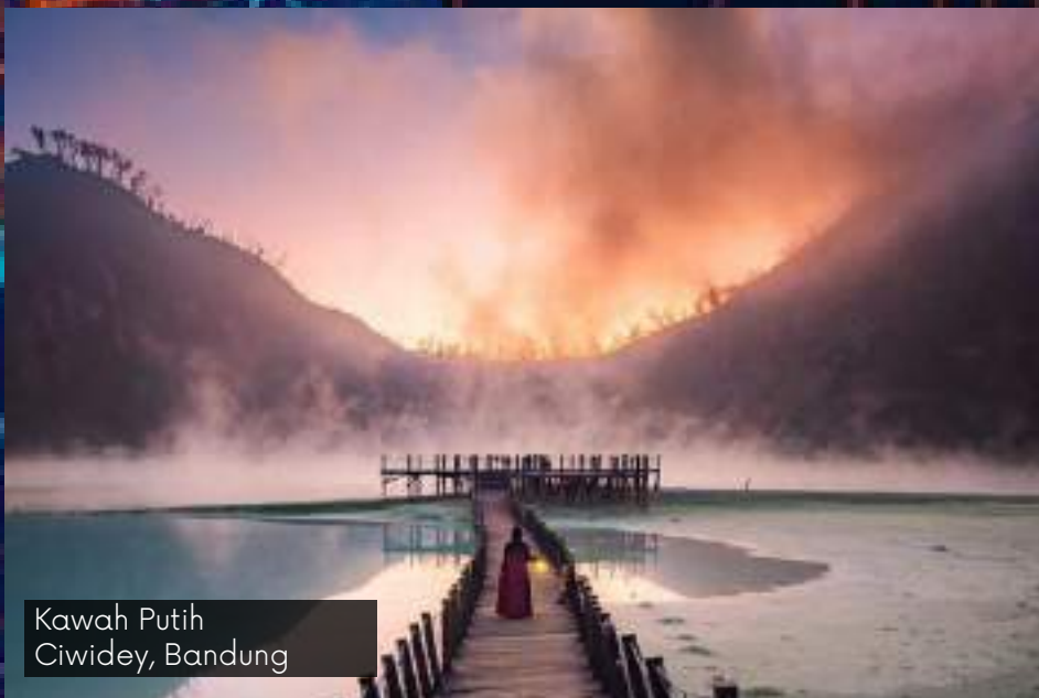
Kawah Putih Ciwidey, Bandung