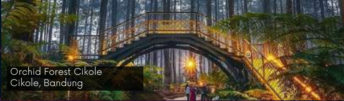
Orchid Forest Cikole Cikole, Bandung